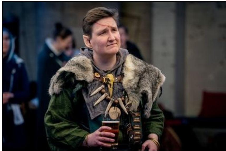
Rane Shardbearer, Senator Kallavesa

Where the trees join the marshes , on the shores of the Westmere, stands the small port of Fisk . Before there was an Empire, Fisk was an armed camp watching the orcs of what is now Mitwold (and later, the Marchers who displaced them). After the formation of the Empire, the warriors largely left Fisk and the traders moved in. Today, Fisk is a small but prosperous port allowing adventurous ship owners to trade with Meade and the Marchers and even with foreigners across the sea as far as the Asavean Archipelago and the Sumaah Republic .